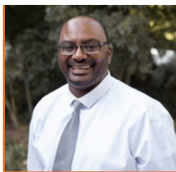
Cluster Education Coordinator